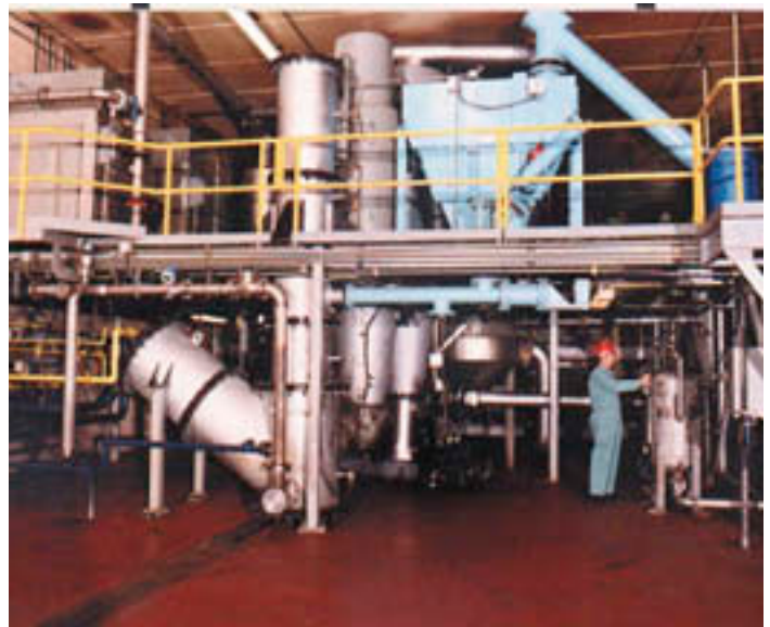
Ensyn Rapid Thermal Processing Commercial Plant

The initial opportunity to test the Conference Board’s conclusions will come over the next several years as biofuel production becomes established in various Canadian rural locations. However, this will be in a situation where a considerable subsidy is provided. In the US, with conventionally produced, highly subsidized bioethanol, large integrated operators have had a clear advantage.